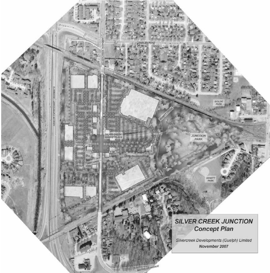
SILVER CREEK JUNCTION Concept Plan Silvercreek Developments (Guelph) Limited November 2007